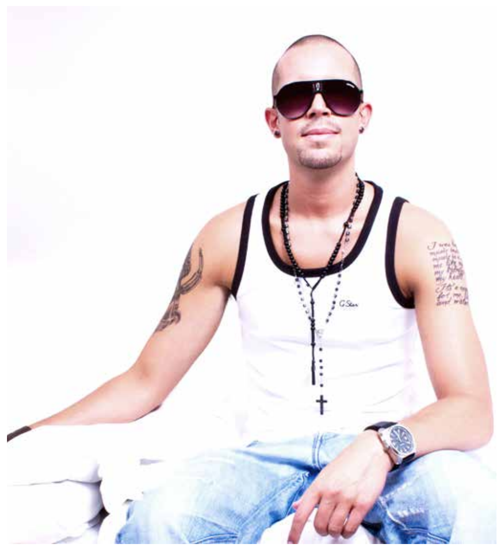
The Swedish R&B artist FreddeRico.

defined Sweden as politically neutral and as an international voice of solidarity working against racism and for gender equality also included the perception that Sweden itself had more or less succeeded in establishing a non-racist society. The stereotype of the gender-equal "new man" that was created within this framework has nevertheless also served to reinforce hegemonic aspects of masculinity by conflating Swedishness with whiteness, middle-classness and heteronormativity. The stereotype of the gender-equal "new man" that was created within this framework has nevertheless also served to reinforce hegemonic aspects of masculinity by conflating Swedishness with whiteness, middle-classness and heteronormativity.